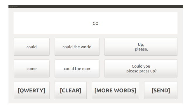
Figure 2: The prototype interface used in the preliminary study. The interface provides various options for text selection including full sentences and a virtual keyboard.

they felt they were able to communicate, and the perceived speed of each entry method.