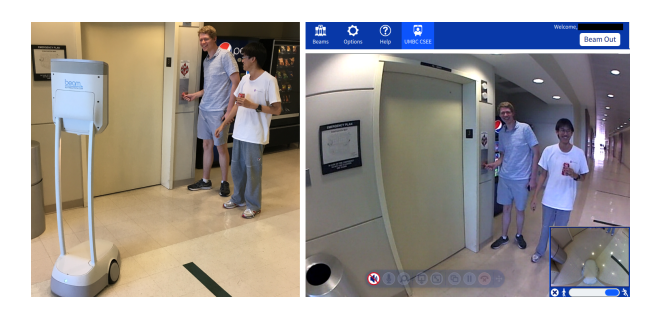
Figure 1: Telepresence-based context and language. (left) Bystanders push a button in response to a verbal request from the robot. (right) Video feed from the robot's sensors. In this example, the most visually salient elements of context are the elevator and people.

(2) Telepresence For the second stage, we will use a telepresence robot (see Figure 1). The Beam robot provides insight into situations that may require assistance (for example, having the robot travel between floors of a building via the elevator, or delivering a package from one office to another). The Beam's existing video cameras and microphone/speaker interactions can be captured to provide a time-aligned corpus.